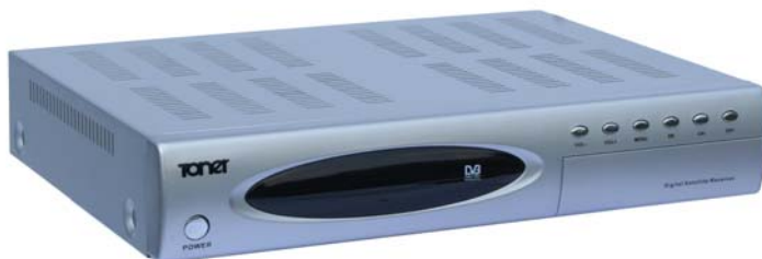
DCM4-HDR High Definition MPEG4 with DVR

Did you know that offering Pay-Per-View can increase your revenue as much as $0.50 to $1.50 per subscriber per month?