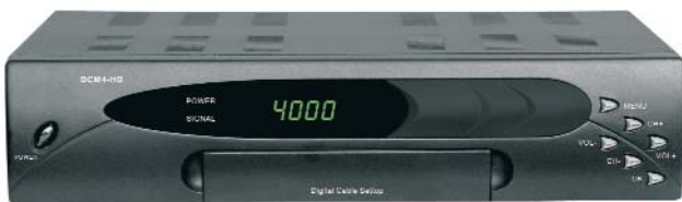
DCM4-HD High Definition MPEG4