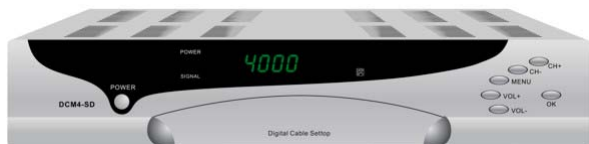
DCM4-SD Standard Definition MPEG4