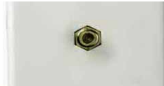
Cable TV Jack