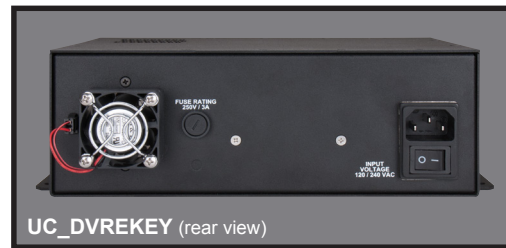
UC_DVREKEY (rear view)