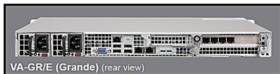
VA-GR/E (Grande) (rear view)