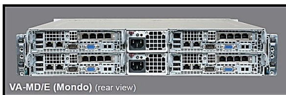
VA-MD/E (Mondo) (rear view)