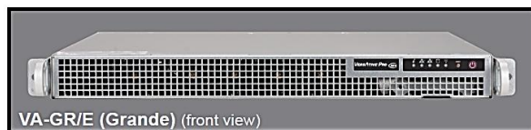
VA-GR/E (Grande) (front view)