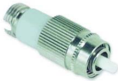
FC/UPC Male to Female