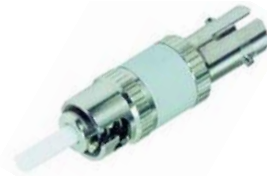
ST/UPC Male to Female