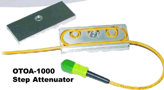
OTOA-1000 Step Attenuator

Optical attenuators are used normally at optical receivers to adjust for the optimum optical input power level to ensure proper operating parameters of the receiver. Both fixed (connectorized) attenuator and variable (step) attenuators are available.