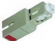
SC/APC Male to Female