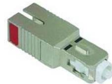
SC/UPC Male to Female