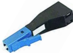
LC/UPC Male to Female