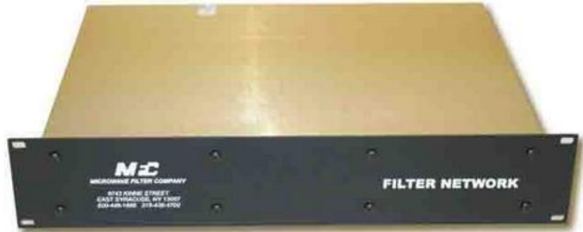
R17700 Rack Mount

Deletes an entire QAM channel for the purpose of reinserting alternate programming (e.g. - Instructional, Security Camera, etc.).