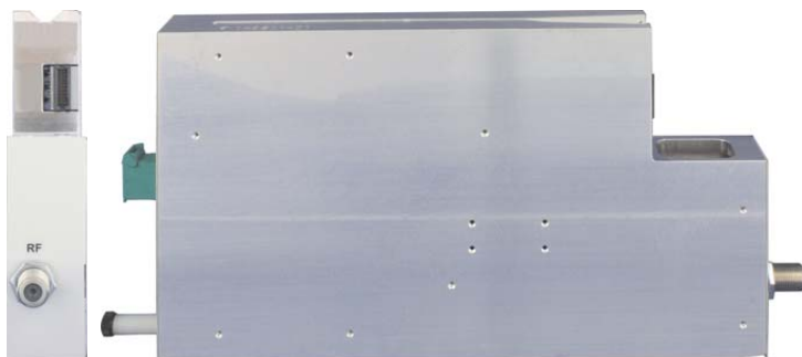
Rear and Side Views of the LP-OLAR LaserPlus Advanced L-Band Receiver