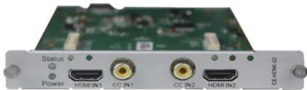
HDMI Encoder Module with CC