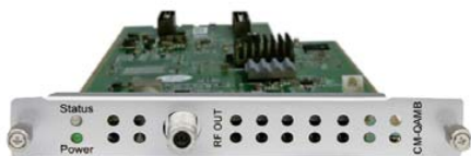
QAMB Modulation Module