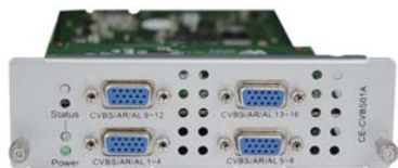
Commercial CVBS Encoder Module