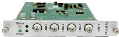
DVB-S/S2 FTA Receiver Module