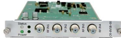
8VSB Receiver Module