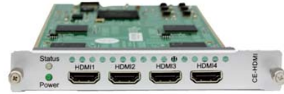
Commercial HDMI Encoder Module