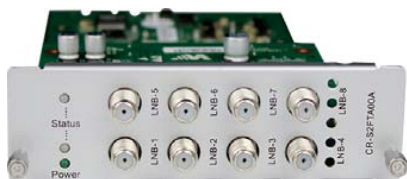
DVB-S/S2 FTA Receiver Module