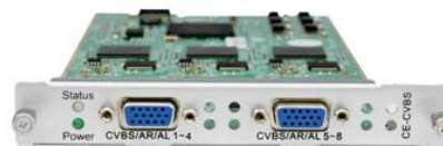
Commercial CVBS Encoder Module