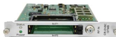
DVB-C Receiver Module