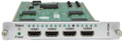
Professional HDMI Encoder Module