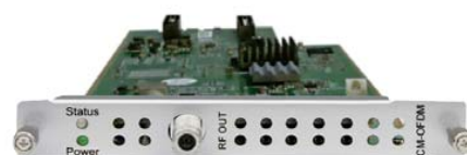
OFDM Modulation Module