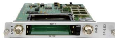
DVB-S/S2 with CI Receiver Module