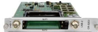
DVB-S/S2 with CI Receiver Module