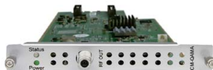
QAMA Modulation Module