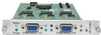
Professional CVBS Encoder Module