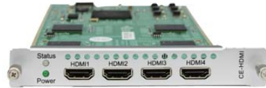
Commercial HDMI Encoder Module (CE-HDMI-01)