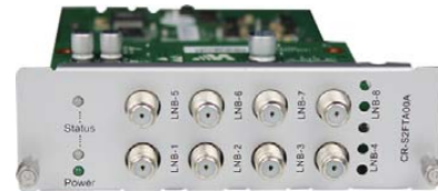
DVB-S/S2 FTA Receiver Module (CR-DVBS2FTA-00A)