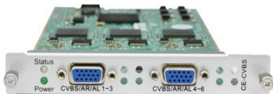
Professional CVBS Encoder Module (CE-CVBS-00)