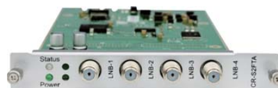
8VSB Receiver Module (CR-8VSB-00)