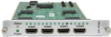
Professional HDMI Encoder Module (CE-HDMI-00)