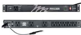
PD-915RV-RN Rackmount Power