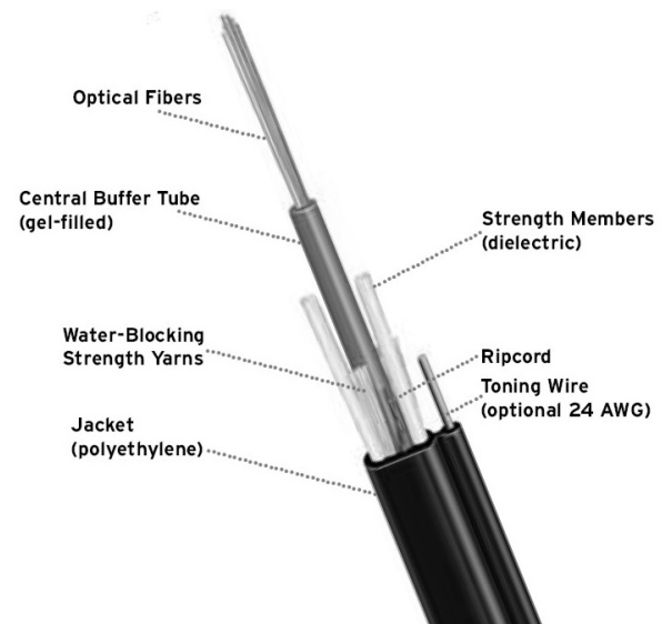
Toneable Flat Drop