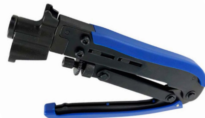
Model EZF-11CT Compression Tool for EZF-11