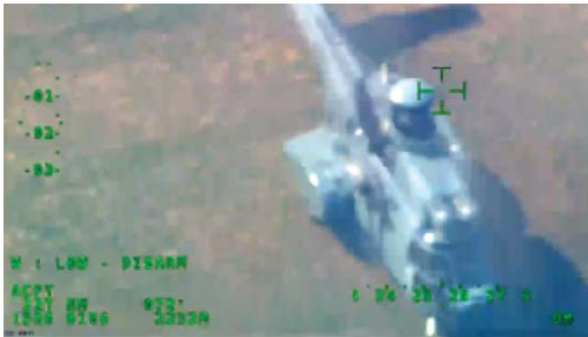
H.264 / AVC - 1080p @ 1.5Mbps