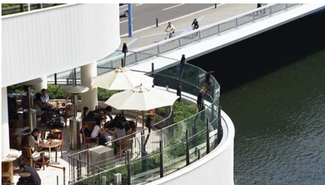
H.264 / AVC - 1080p @ 6Mbps