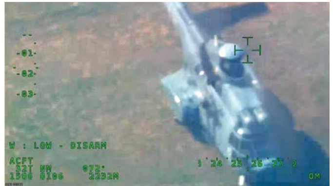
H.265 / HEVC - 1080p @ 1.5Mbps