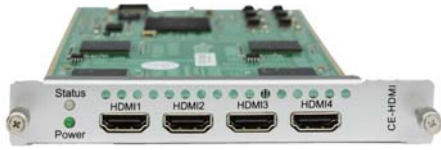
Professional HDMI Encoder Module (CE-HDMI-00)