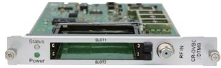
DVBC Annex B/ISDB-T Receiver Module (CR-DVBC-01)