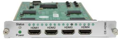
Commercial HDMI Encoder Module (CE-HDMI-01)