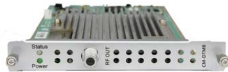
DTMB Modulation Module (CM-DTMB-01/01A)