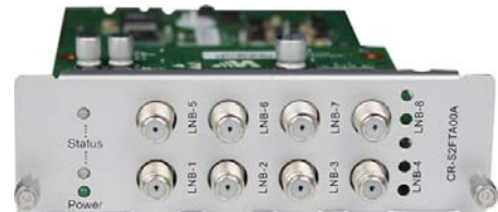
DVB-S/S2 FTA Receiver Module (CR-DVBS2FTA-00A)