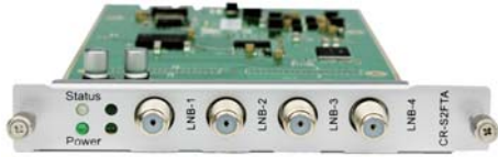
DVB-S/S2 FTA Receiver Module (CR-DVBS2FTA-00)