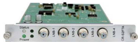
8VSB Receiver Module (CR-8VSB-00)