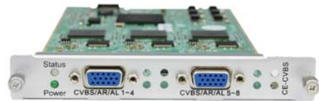
Commercial CVBS Encoder Module (CE-CVBS-01)