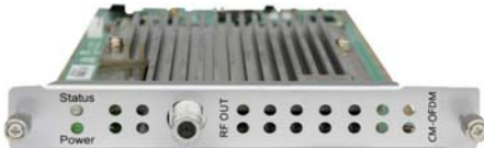
OFDM Modulation Module (CM-OFDM-01/01A)