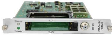
DVB-C/DTMB Receiver Module (CR-DVBC-00)