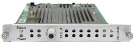
QAMA Modulation Module (CM-QAMA-01/01A)