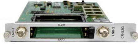
DVB-S/S2 with CI Receiver Module (CR-DVBS2CI-00)