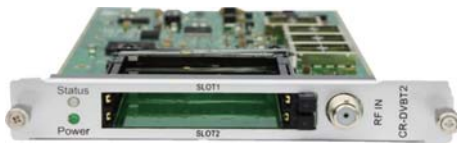
DVB-T/T2 Receiver Module (CR-DVBT2-00)