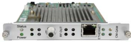
QAM Modulation Module (CM-QAMA/QAMB-00)