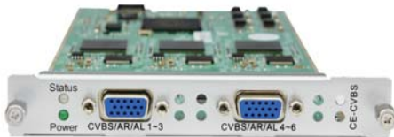
Professional CVBS Encoder Module (CE-CVBS-00)