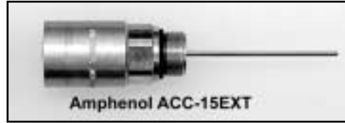
Straight Extension Adapter ACC-XXEXT