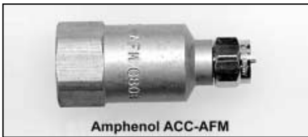
F Male to Pin Connector ACC-AFM