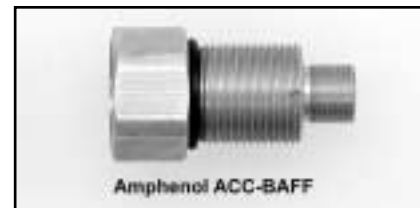
F Female to Pin Connector ACC-BAFF