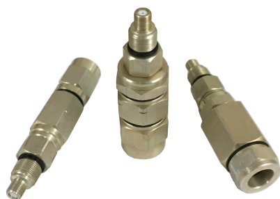
T2-500-BAFF | T2-625-BAFF | T2-750-BAFF .500 / .625 / .750 to Female Connector